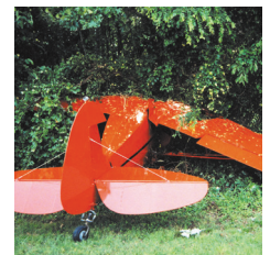
Accident Prevention Part 2 P6