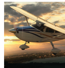
Finding the Right Plane P1